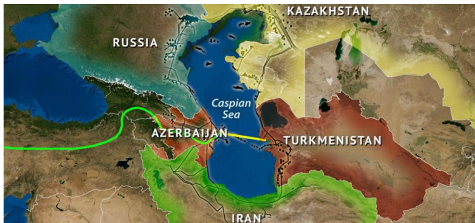
Figure number 2.

The Caspian's symbolic location importance stems from its availability of energy-rich resources. Huge amounts of hydrocarbon resources are found in the water, both in sea deposits and inland areas in the immediate area. It is believed that the Caspian has 480 million barrels of crude oil and 8.7 trillion cubic meters of gas in known or probable reserves (Chausovsky, 2014).