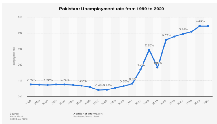
Graph 1. Unemployment Rate in Pakistan (1999-2020)

There are continuous variations in the unemployment rate of Pakistan. Unfortunately, contrary to the manifesto of the PTI government that it would provide 10 million jobs, the country was facing highest unemployment rate of the two decades i.e., 4.45 percent during 2020.